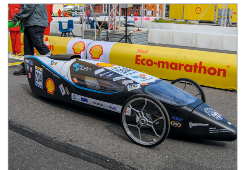
The Prototype IDRA - hydrogen fuel cell category- at the Shell Eco-marathon.

“Our main goal is to participate in the Shell Eco-marathon with a great car and possibly win the competition. We are striving to share the Shell Eco-marathon values by combining a sustainable development with a vehicle that uses the least possible amount of energy, and HyperWorks did a great deal to support this effort. We believe that the competition is a perfect way to achieve excellence. It gives us the possibility to work hard in order to challenge the competitors and to produce a more advanced technology vehicle that could become benchmark for its category.”