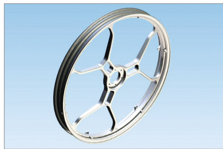
CAD model built in solidThinking Inspire