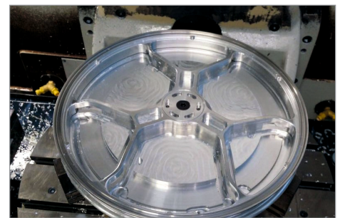
Wheel rim in the milling manufacturing step